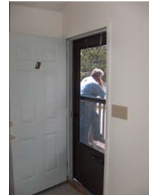
Security Doors & Screen Door