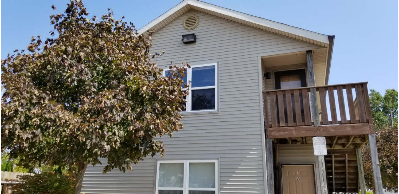
Building Security Lighting-New Stairwells & New Paving 2013.