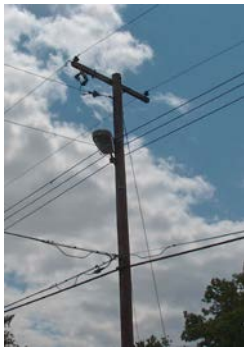
Parking Lot Security Light