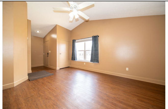
Upstairs Entry Foyer-Apt #3