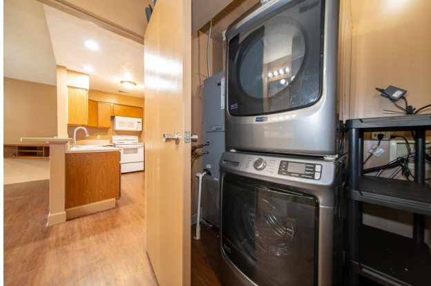
Laundry Area (off Bathroom)