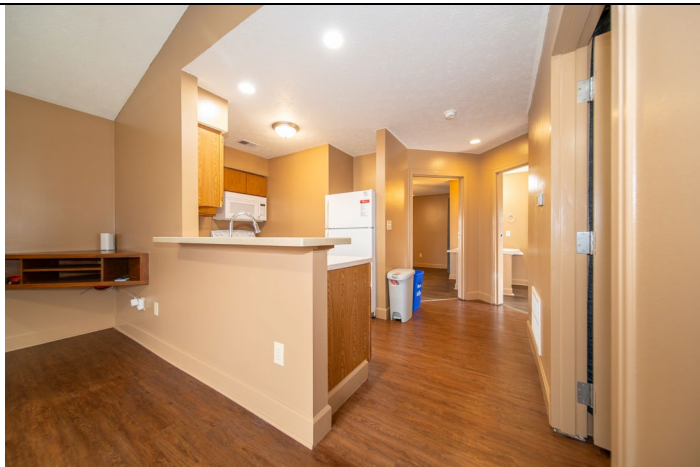
Upstairs Breakfast Bar in Kitchen Area-Apt #3