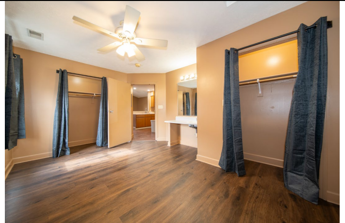
Ceiling Fans (in each Bedroom + Great Room)