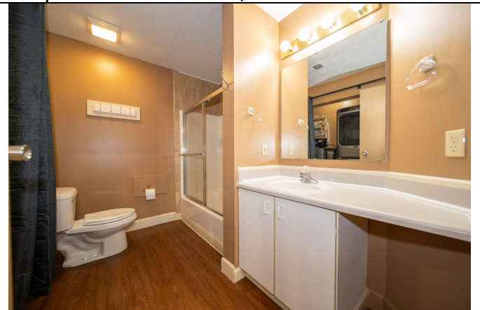
Bathroom (off Hallway)