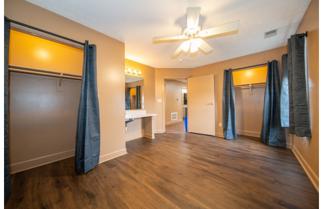
Vanity Sink & Twin Closets in Each Bedroom