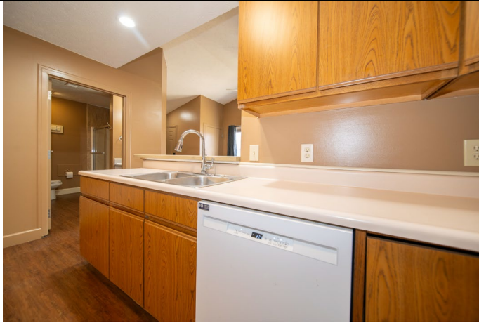
Kitchen (view from Hallway)