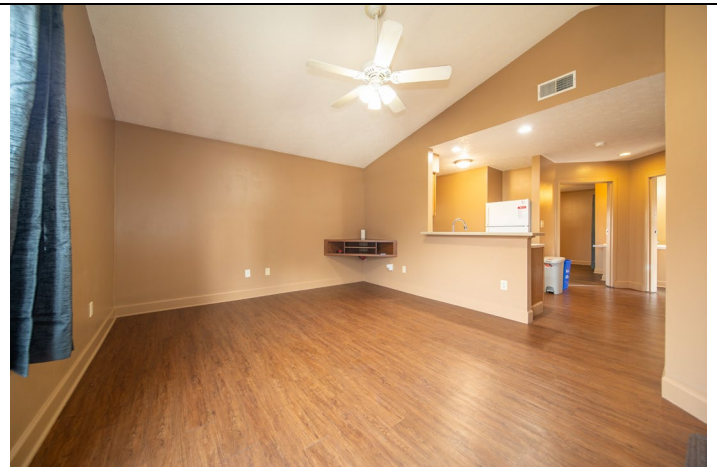
Upstairs Great Room w/TV Stand: 16'2"x13'0"