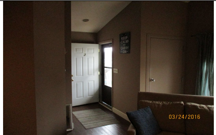
Upstairs Entry Foyer-Apt #3