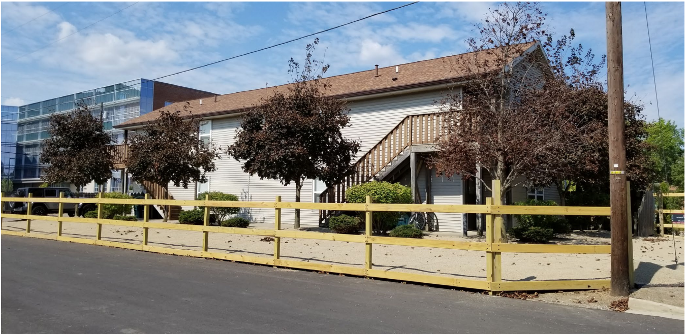
East side of building facing Dicks Street. Apt 4 on top, Apt 1 on bottom.