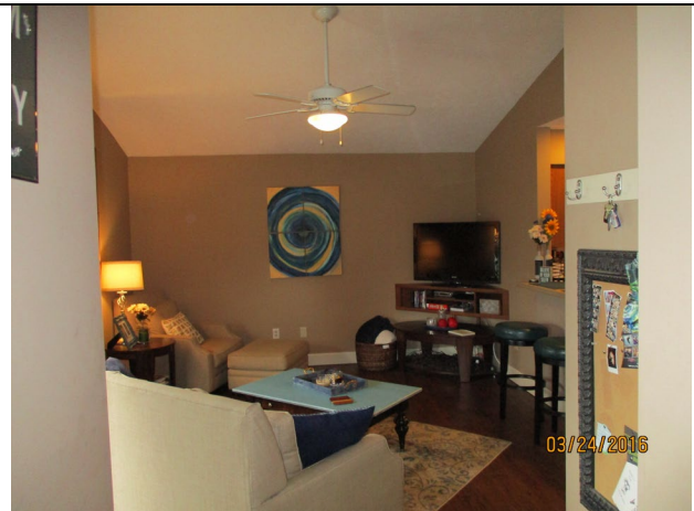
Upstairs Great Room: 16'2"x13'0"