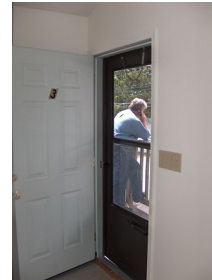
Security Doors & Screen Door