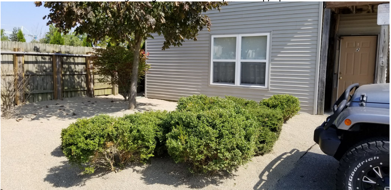
West side of building facing Beechwood parking lot. Apt 3 on top, Apt 2 on bottom.