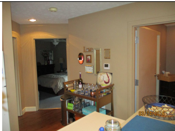
Hallway view to Bedrooms & Kitchen