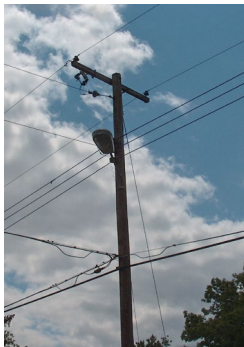
Parking Lot Security Light