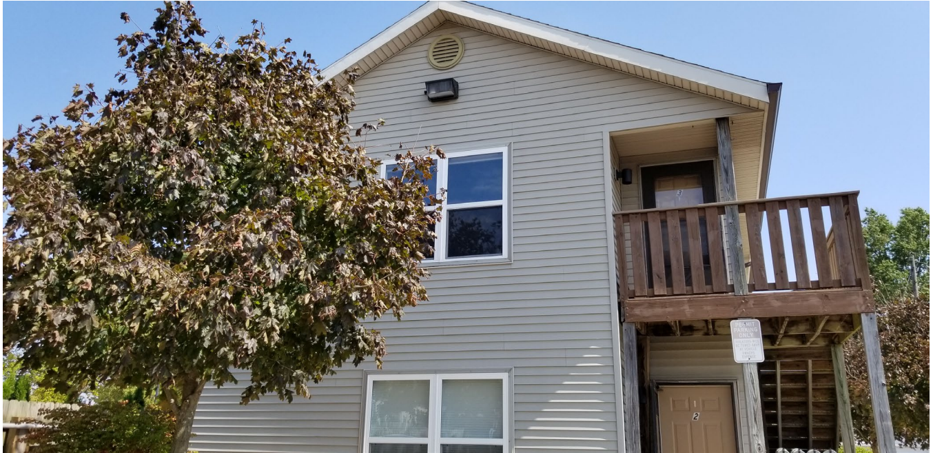
Building Security Lighting-New Stairwells & New Paving 2013.