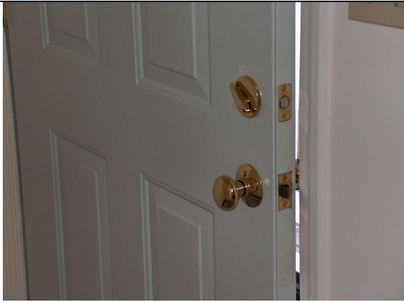
Deadbolt Security Lock