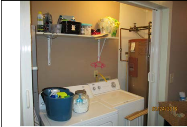
Laundry Area (off Bathroom)