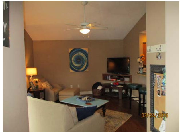
Upstairs Great Room: 16'2"x13'0"