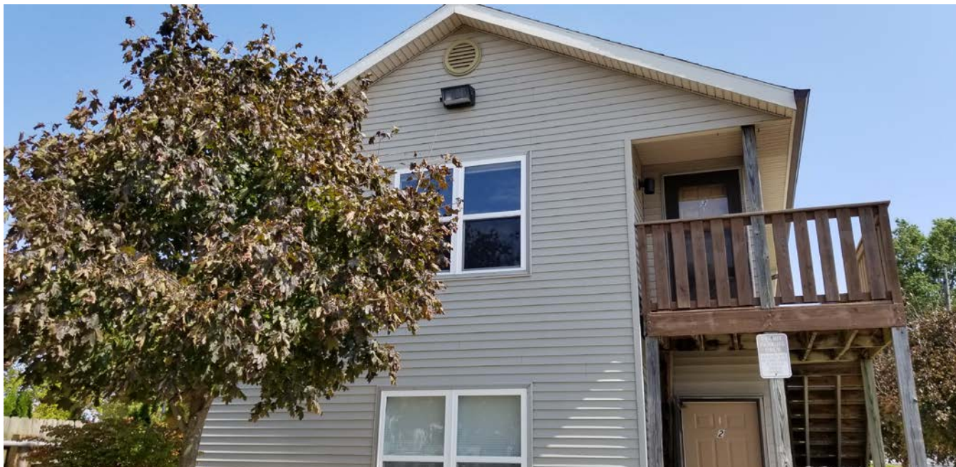
Building Security Lighting-New Stairwells & New Paving 2013.