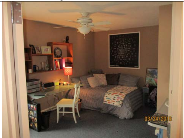
Ceiling Fans (in each Bedroom + Great Room)