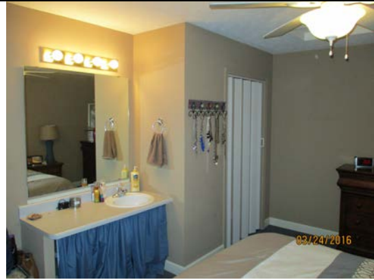
Vanity Sink in Each Bedroom