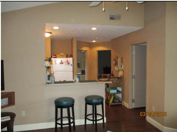
Upstairs Bar in Kitchen Area