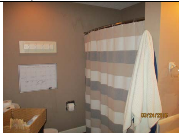
Bathroom (off Hallway)