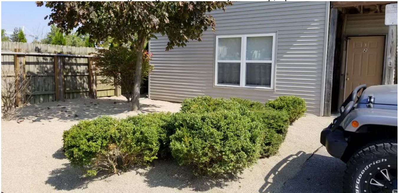
West side of building facing Beechwood parking lot. Apt 3 on top, Apt 2 on bottom.