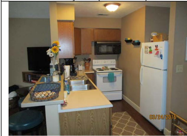
Kitchen (view from Hallway)