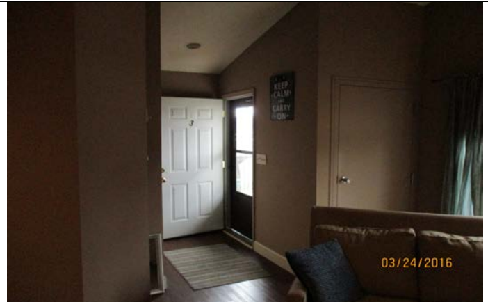
Upstairs Entry Foyer