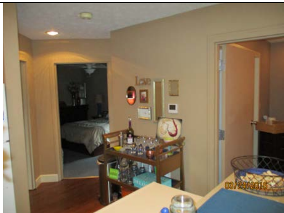
Hallway view to Bedrooms & Kitchen