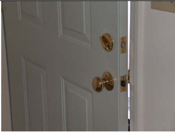
Deadbolt Security Lock