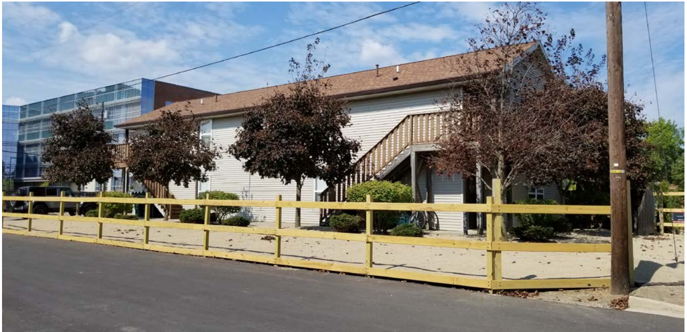
East side of building facing Dicks Street. Apt 4 on top, Apt 1 on bottom.