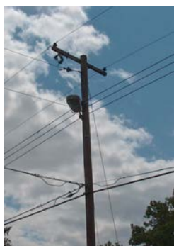
Parking Lot Security Light